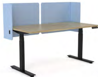
E-panel Corner Screens (Left & Right) Pearl Grey with Black brackets