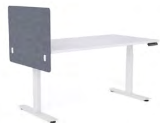
E-panel Side Screen Marl Grey with White brackets