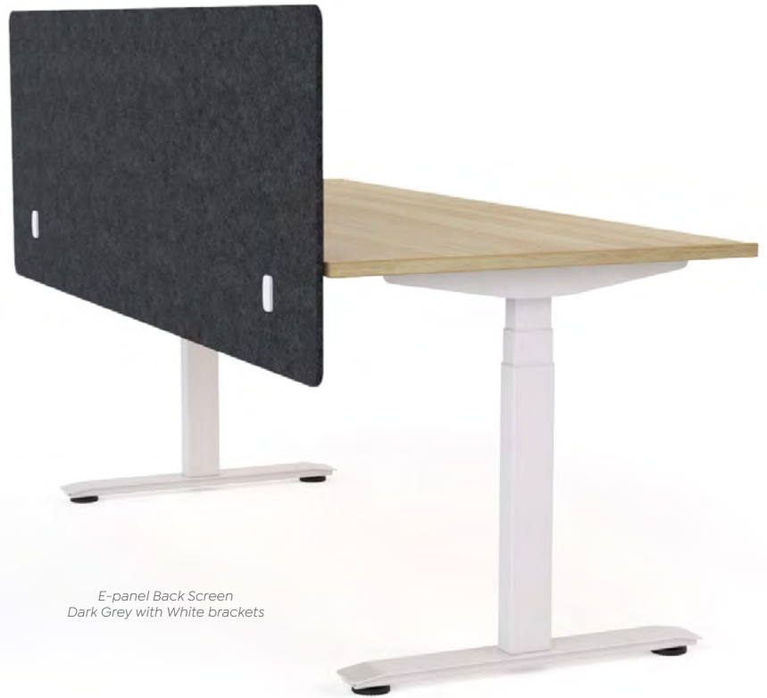
E-panel Back Screen Dark Grey with White brackets