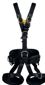
TECHNIC ANSI STANDARD