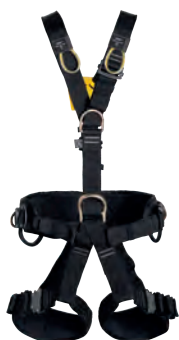
TECHNIC ANSI SPEED