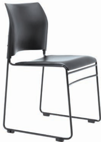
Maxim Black - Black Powder Coat Frame