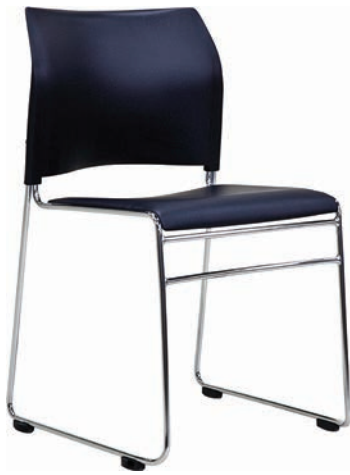
Maxim Black - Chrome Frame