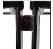
Maxim with heavy-duty linking system (Indent only)