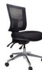
Featured with aluminium base