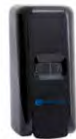
1000ml Dispenser Black