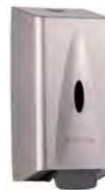
1000ml Stainless Steel Dispenser