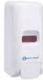
1000ml Dispenser White