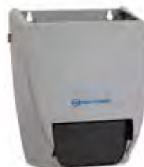
Industrial Soap Dispenser