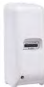
Automatic 1000ml Dispenser